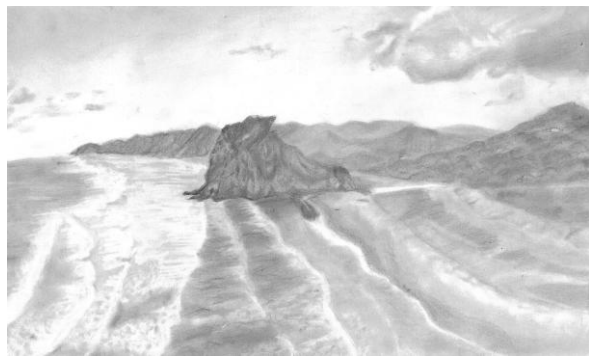
Kylie Fatima Naparate